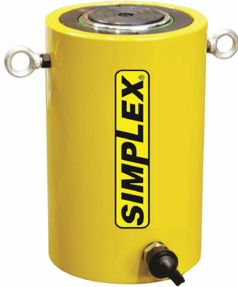
RLS201 Shown See table for additional models

Simplex RLS Series provides the ideal fit and force required for most bridge lifting and pier cap maintenance jobs. Compact, light weight and tough as nails, Simplex cylinders are at home on any construction site.